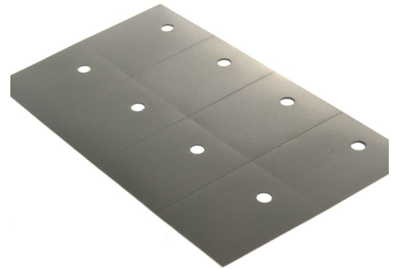
Standard SILTEL SF-TC3.0 Cross Section